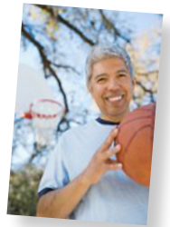
User: BostonGeorge Likes: Getting people involved in physical activities